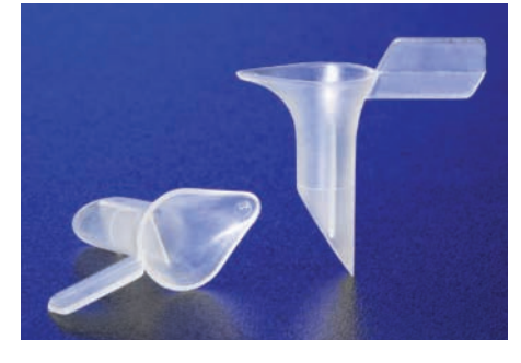
Piercing Funnels For use with the Sedi-Rate<sup>™</sup> ESR System.