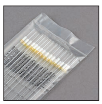
1710 - Sterile, bulk pack 1715 - Non-sterile, bulk pack