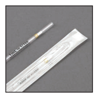
1700 - Sterile, individually wrapped