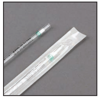
1720 - Sterile, individually wrapped