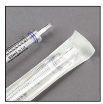
1820 - Sterile, individually wrapped