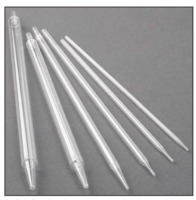
The Globe Scientific aspirating pipettes are availbale in 1mL, 2mL, 5mL, 10ml, 25mL and 50mL sizes.