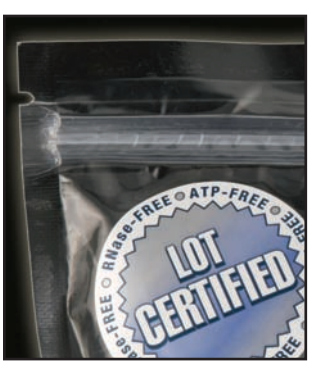
Item# 3004 (shown actual size)