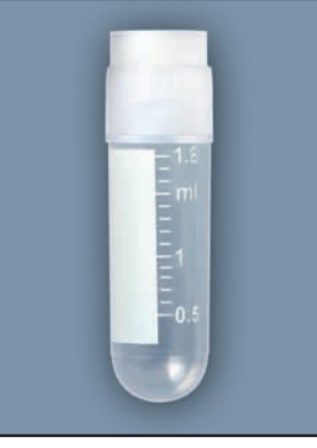
Item# 3011 (shown actual size)

All CryoClear<sup>™</sup> cryogenic vials are