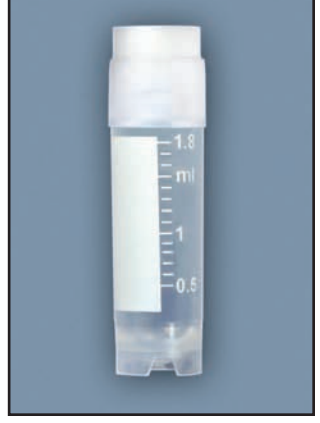
Item# 3012 (shown actual size)