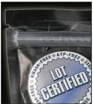
All CryoClear<sup>™</sup> cryogenic vials are sold in tamper evident, resealable plastic bags. 50 vials per bag, 10 bags per case.