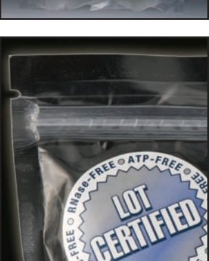
Item# 3014 (shown actual size)

All CryoClear<sup>™</sup> cryogenic vials are sold in tamper evident, resealable plastic bags. 50 vials per bag, 10 bags per case.