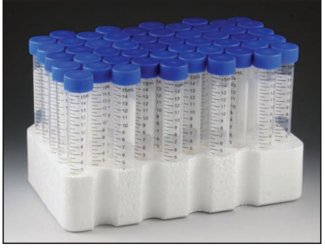
Item# 6286 in 50 place rack