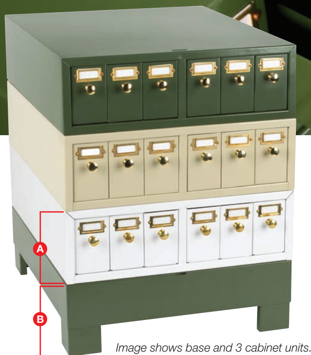
Image shows base and 3 cabinet units.