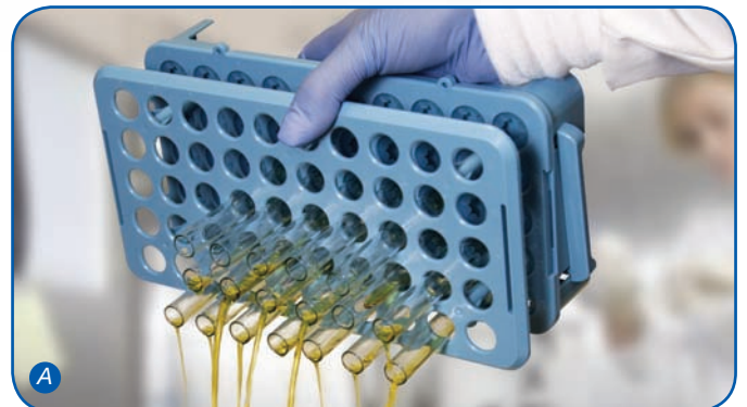
Both racks feature rubber grips that hold tubes securely in place when decanting liquids.