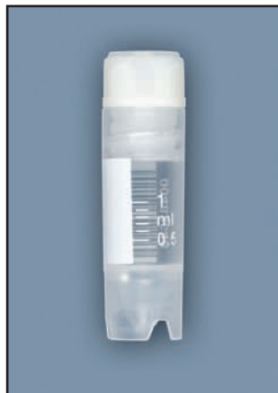
Item# 3001 (shown actual size)