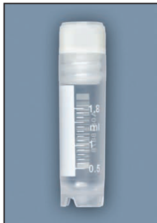
Item# 3002 (shown actual size)