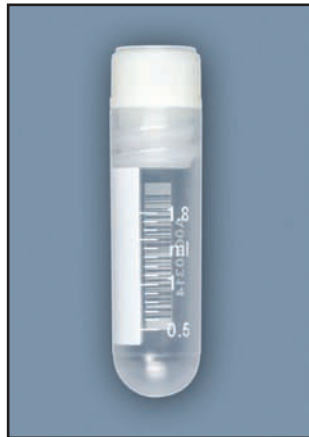
Item# 3003 (shown actual size)