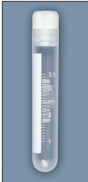
Item# 3004 (shown actual size)

All CryoClear™ cryogenic vials are sold in tamper evident, resealable plastic bags. 50 vials per bag, 10 bags per case.