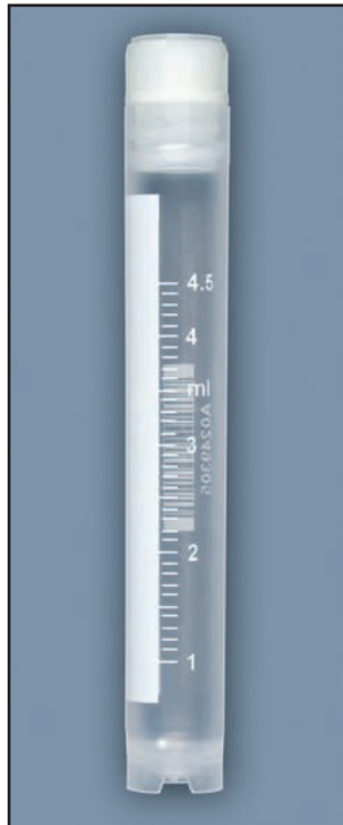
Item# 3008 (shown actual size)

All CryoClear™ cryogenic vials are sold in tamper evident, resealable plastic bags. 50 vials per bag, 10 bags per case.