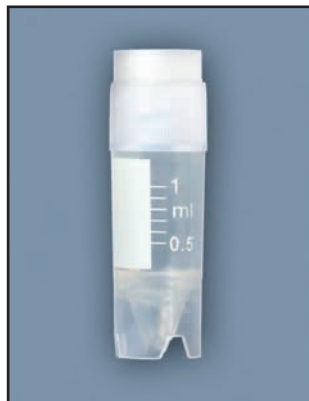
Item# 3010 (shown actual size)