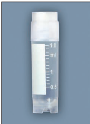
Item# 3012 (shown actual size)