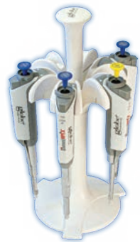
Item #3358 Carousel stand holds up to 6 Diamond® APEX™ single channel pipettors. Sold separately.