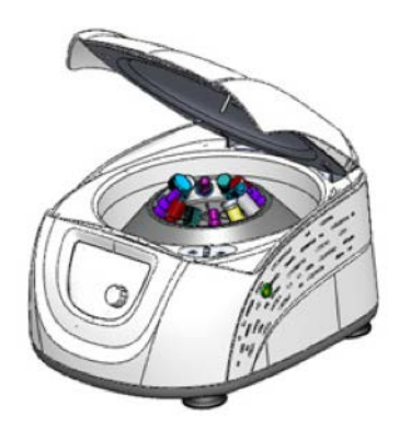
2) Remove foam pads at the hinge latch and from around the rotor.

1) Press the button on the right side to open the lid.