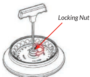
Load the Rotor Onto the Shaft