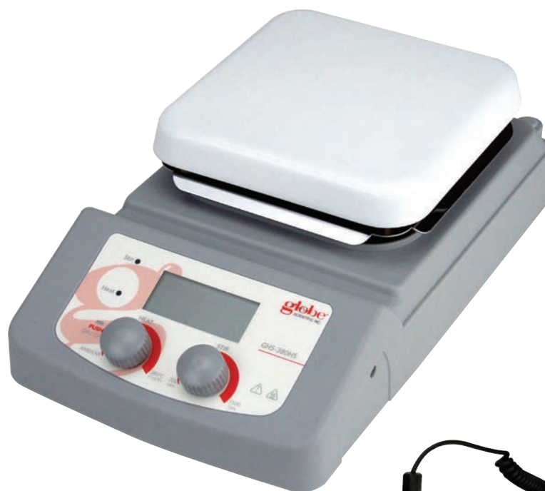
GHS-380HS with optional temperature sensor and support stand installed.