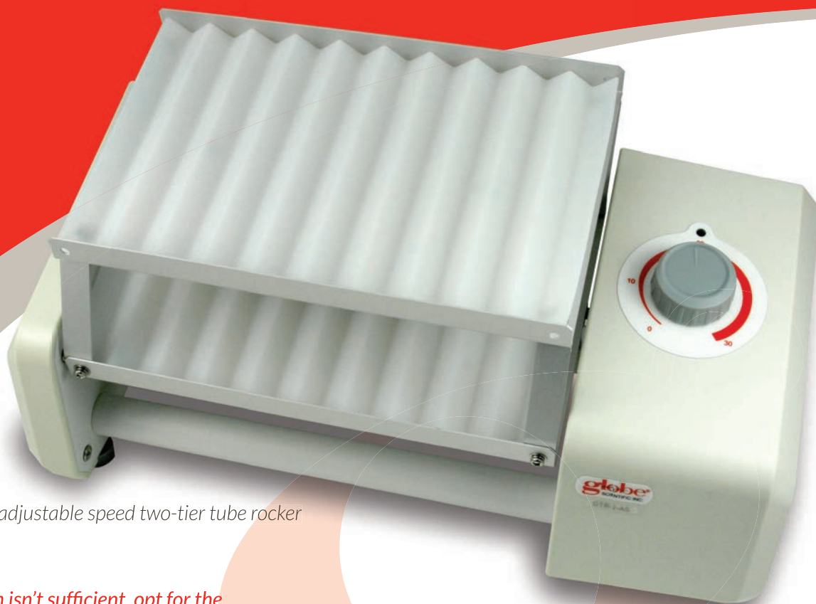
GTR-2-AS adjustable speed two-tier tube rocker

When one platform isn't sufficient, opt for the space-efficient design of Globe Scientific's GTR-2-AS!