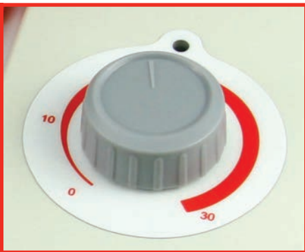
Radial dial for simple speed adjustment from 0 to 30rpm