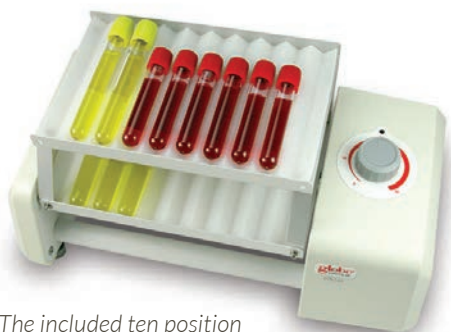
The included ten position silicone inserts are compatible with 5-10mL specimen collection tubes