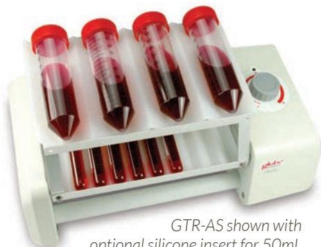
GTR-AS shown with optional silicone insert for 50mL centrifuge tubes (available separately)