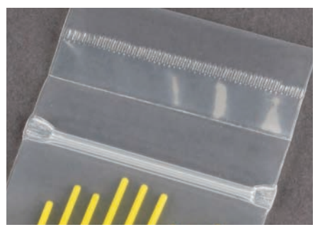
Packaged in resealable, tamper-evident bags