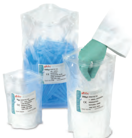
Say goodbye to spilling tips all over the benchtop!