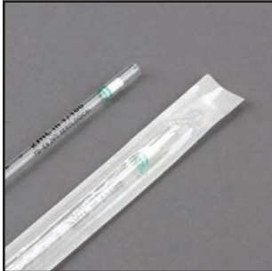
1720 - Sterile, individually wrapped