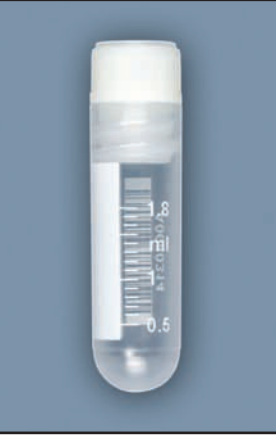
Item# 3003 (shown actual size)

sold in tamper evident, resealable plastic bags. 50 vials per bag, 10 bags per case.