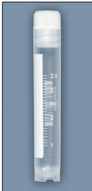
Item# 3005 (shown actual size)

All CryoClear™ cryogenic vials are sold in tamper evident, resealable plastic bags. 50 vials per bag, 10 bags per case.