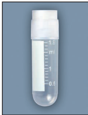
Item# 3011 (shown actual size)