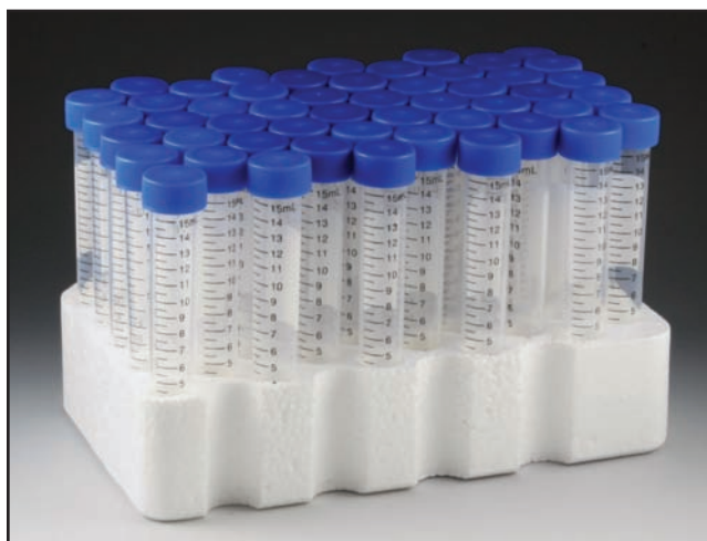
Item# 6286 in 50 place rack