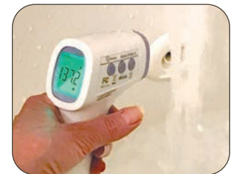
Measure bath water temperature