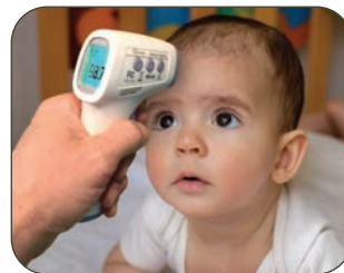
Measure body temperature