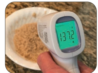
Measure food temperature