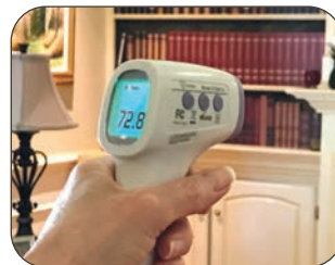
Measure room temperature